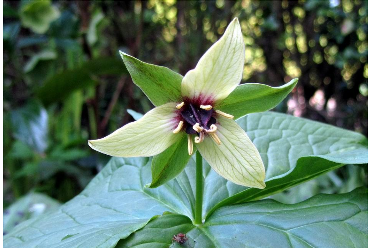
When we grow a number of these species together in our gardens hybridisation occurs.

Both the plant in the previous picture and this one are often called Trillium albidium and have gone under that name for many years in Scotland at least. The more I read the available literature on these beautiful plants the more confused I become and I have to draw the conclusion that they, like so many plants, do not conform to the taxonomy – especially when growing in gardens. The one immediately above has bigger petals that display a deep pink centre and it has a beautiful scent – it looks to me to be intermediate and perhaps a hybrid of Trillium chloropetalum. I learned many years ago not to let the confusion in the precise names of these plants to get in the way of my enjoying them in our garden.