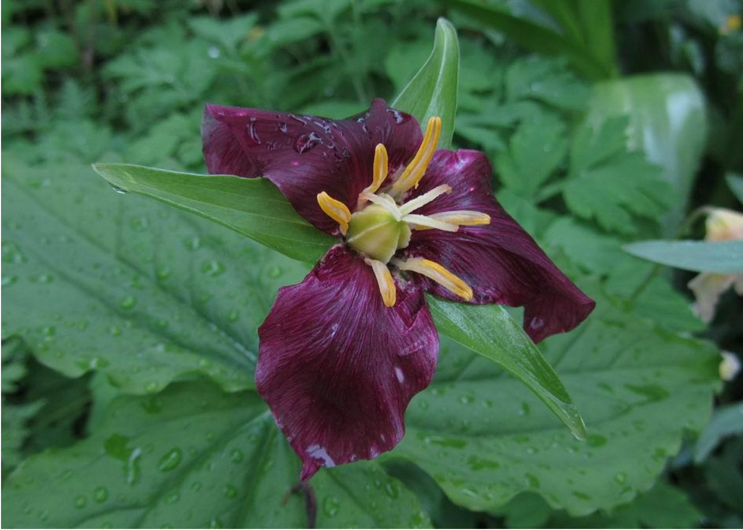
When it first opened the flower on this Trillium ovatum was purest white but as the flower ages the anthocyanin's develop bringing first a slight pink flush which deepens until it is a rich deep purple.