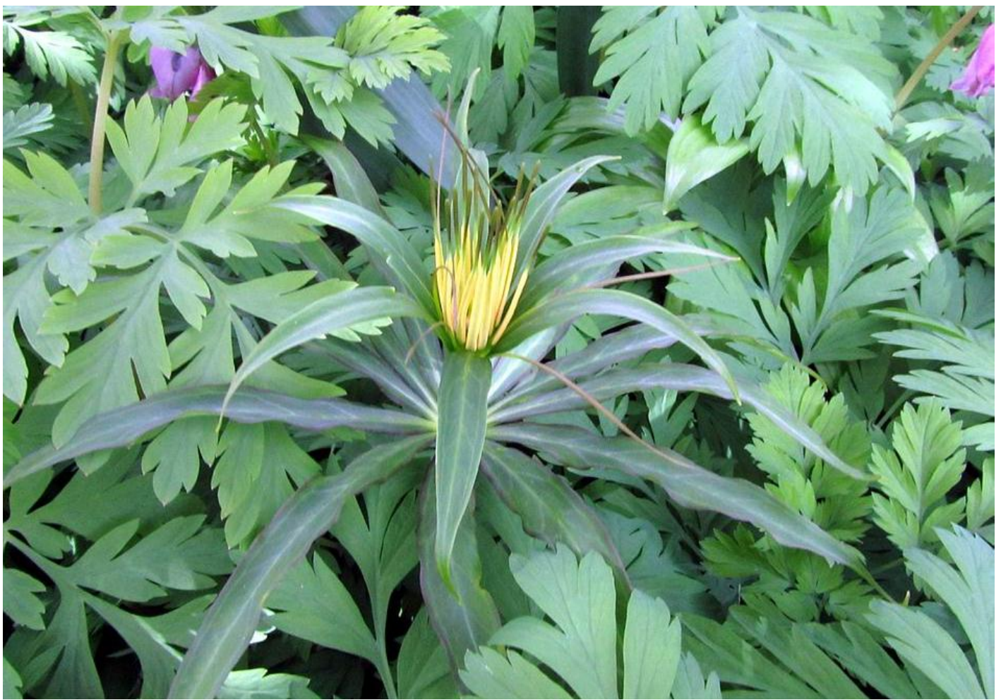
Paris polyphylla growing happily through Dicentra formosa