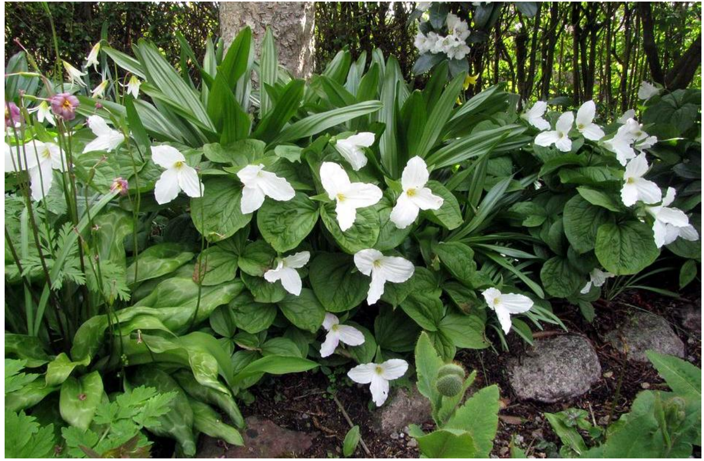
Trillium grandiflorum also exhibits this colour change as the white flowers take on a pink flush as they age but in our garden they never go quite as dark as those of the Trillium ovatum shown earlier. Just now as the flowers start to fade is also the time I will lift and split the bigger clumps of Trilliums.