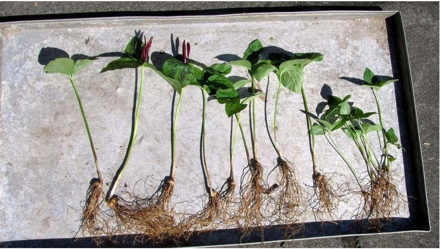
With our open gritty compost it is relatively easy to get the plants separated out so the roots are for the most part undamaged.

Understanding the type of storage structure you are working with being it a bulb, corm, tuber, rhizome – and its exact growth cycle so you know what it is doing and when is the key to being able to grow bulbs or any plants better.