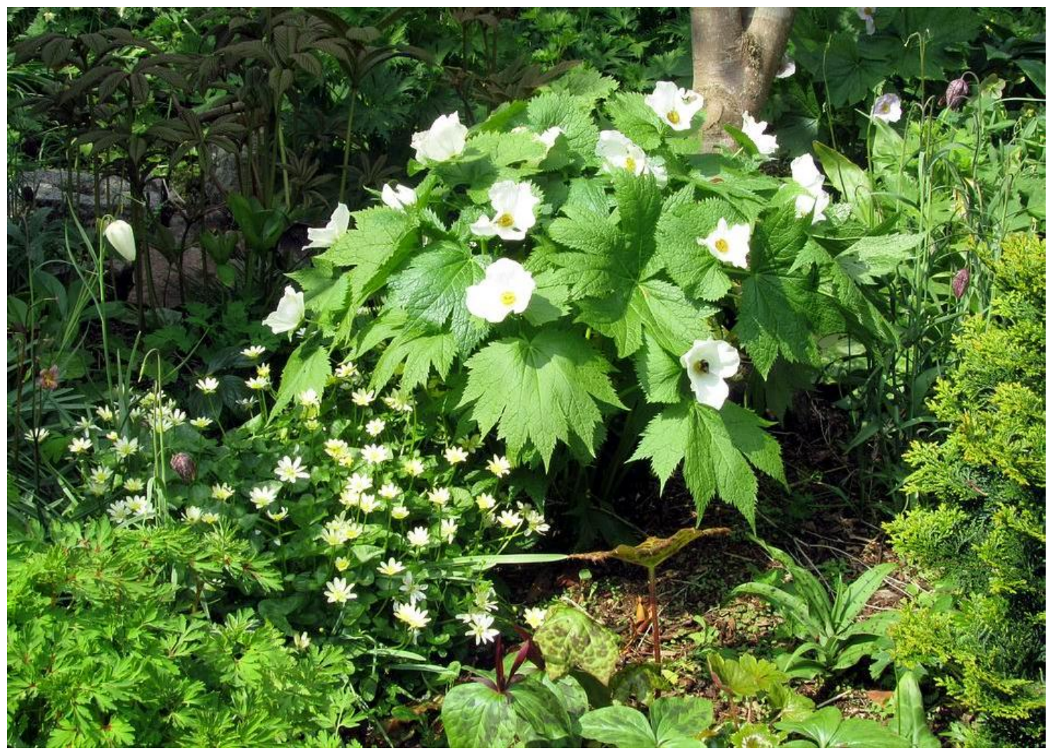
Glaucidium palmatum album