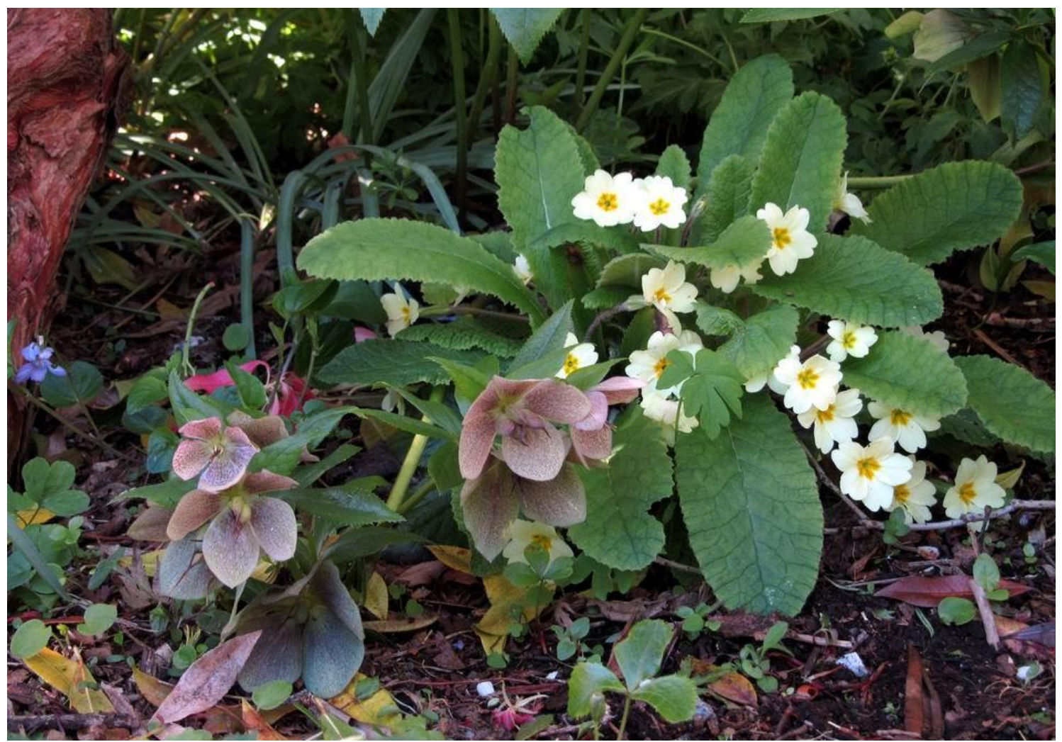
The decorative part of the Hellebore flowers are the bracts so they persist providing interest long after the true petals have dropped here it is complementing the common primrose – Primula vulgaris.....